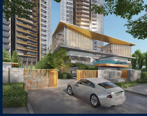
3 - Bedroom