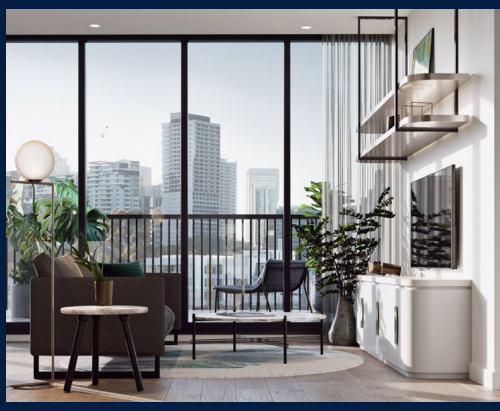
Roden : 3 - Bedrooom + Study