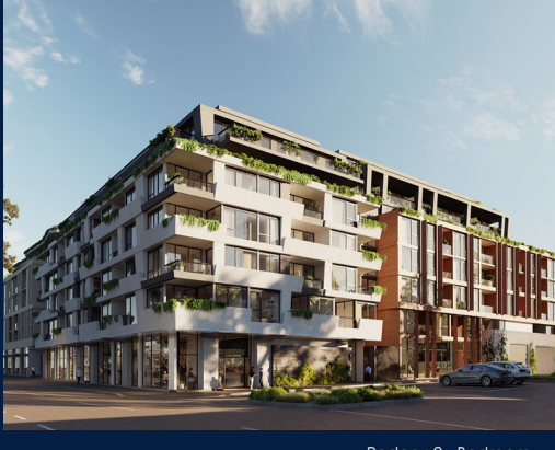
Roden: 2 - Bedroom