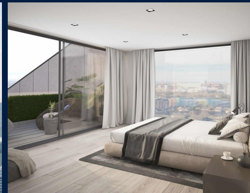
Graphene | Enigma | Element : 1 - Bedroom