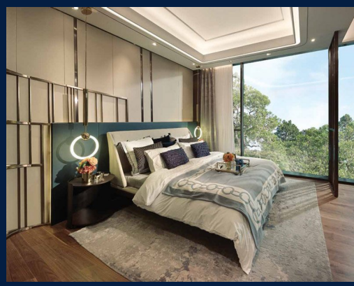
3 - Bedroom Exclusive