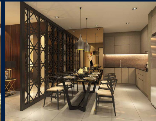
1 - Bedroom Studio