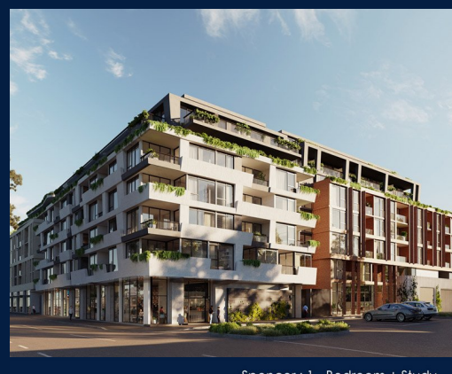
Spencer: 1 - Bedroom + Study