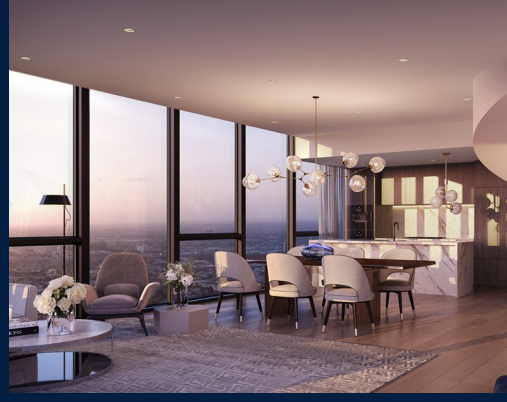
2 - Bedroom