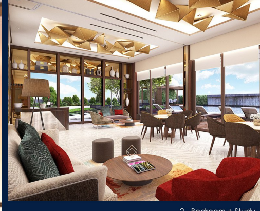
2 - Bedroom + Study